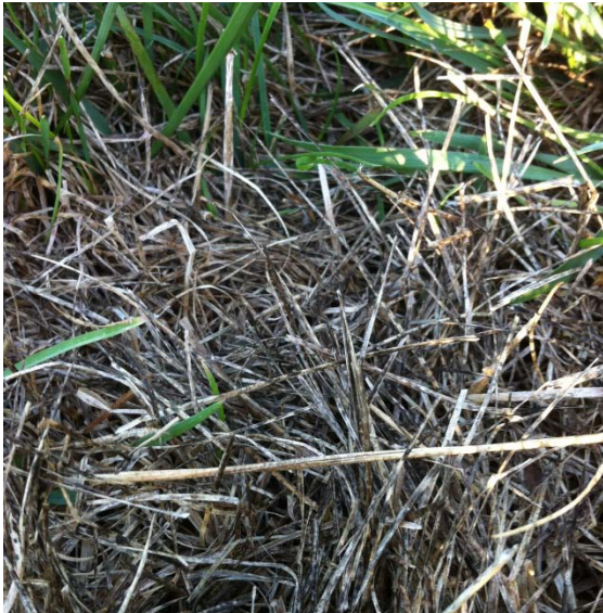
Figure 1. Dead grass usually takes on a grayish black appearance and is very soft and “mushy” to the touch.