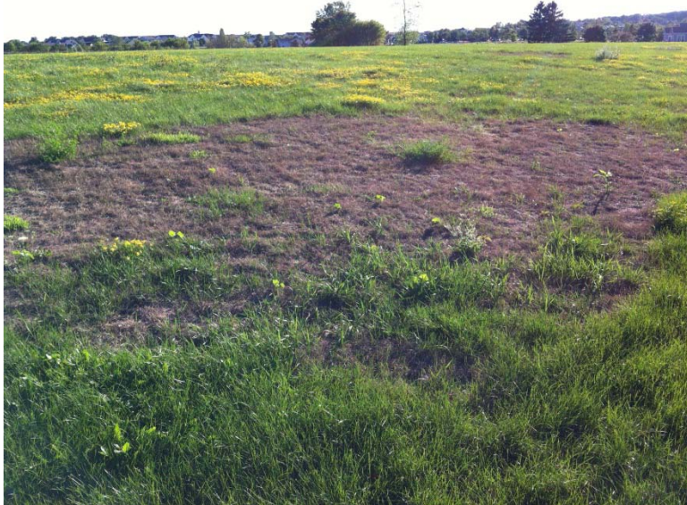
Figure 2. This large brown patch of grass is mostly dead, but there are many single plants of Kentucky bluegrass interspersed throughout it. Expansion of these small plant and expansion of surrounding Kentucky bluegrass into the dead area is expected to dramatically shrink the size of this area by September, although it is likely some of this area will need to be re-seeded or sodded.