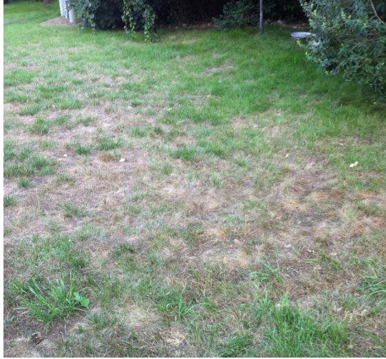
Figure 3. This lawn has a large amount of dead grass, most of which was fine fescue. The area that will need to be re-seeded or sodded is expected to be much smaller by September as the living grasses fill in.