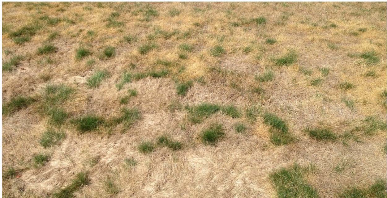
Figure 4. Of all the turf types, fine fescue surprised me the most with its poor survivability. Fine fescues are considered more drought tolerant than Kentucky bluegrass in all the textbooks. However, the majority of non-irrigated fine fescue areas I've seen are dead. If fine fescue is planted along with Kentucky bluegrass, this is not a major issue as the bluegrass will fill in; but major renovation will be required of areas where fine fescues were the only species. I've noticed the areas where fine fescue has survived are those where no thatch exists and the crowns are underneath the soil surface. Because fine fescues have a tendency to form thatch, these grasses should not be planted unless thatch can be prevented – which is not an easy task for a non-professional turf manager. This lawn will likely need to